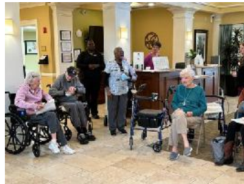
The lady standing sang Amazing Grace