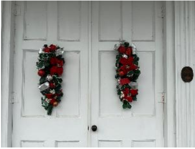
Starting with Decorating the church