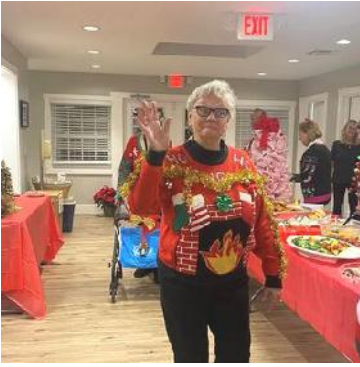
Parade of other Ugly Sweaters...