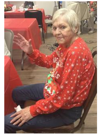
Everyone enjoyed our Christmas Cantata on Dec. 10 th