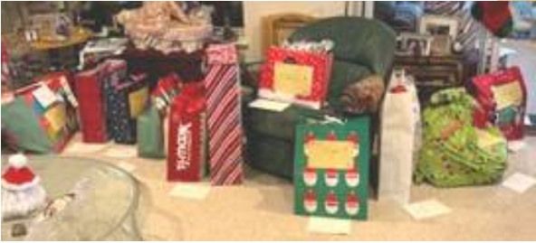
Several congregants went to Canterfield on Christmas Eve to give communion and sing carols with the residents.