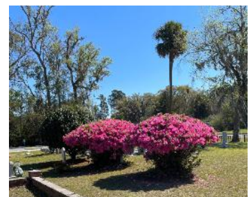
Beautiful azaleas in our church cemetery