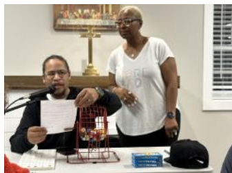
BINGO NIGHT and ICE CREAM SOCIAL