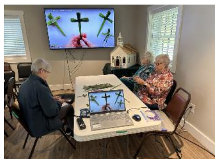
Making Palm Crosses...