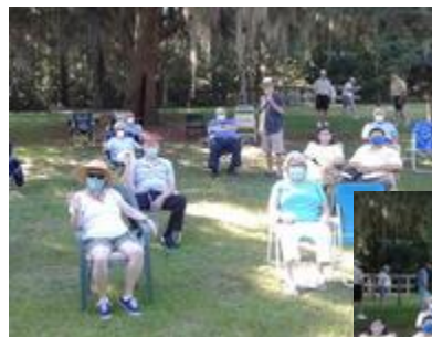
Look how peaceful this setting is.