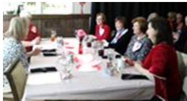
Getting to know each other!