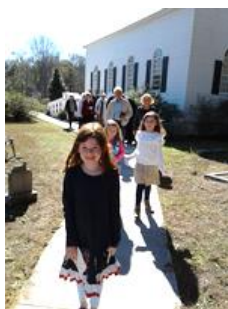
Thanks to the Scouts!!