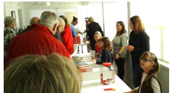
Cookie sales going great!

Since we have a Troop that meets at St. Luke's we were agreeable to have them sell their delicious cookies to the congregation. It was a great time! The Scouts setup their tables with choices of cookies in the Fellowship Hall. After each service, many of us took advantage and bought lots of cookies. Check out the photos of that day.