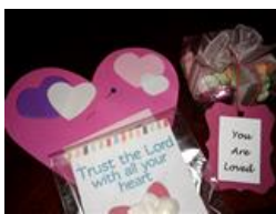
Name Tag & favors

On February 22, the ladies of St. Luke's gathered at Oak Terrace restaurant in the Rose Hill community for lunch, fellowship and great conversation. Thirty-four ladies, five of whom were guests, spent time getting to know more about each other than can be discovered during coffee hour on Sunday morning. The theme was "They will know us by our love" and anyone peeking into the room that day would have seen love and caring in abundance! Love becomes a natural expression when we are in relationship with each other and when Christ is present where two or three... (or 34!) are gathered in His name. We look forward to future opportunities to come together and express our love for each other as sisters in Christ.