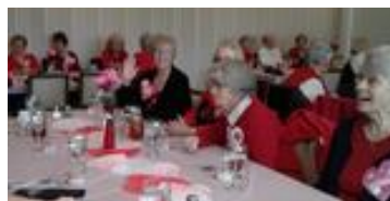
"RED" was the color of the day!!!