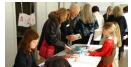
More cookie sales!!