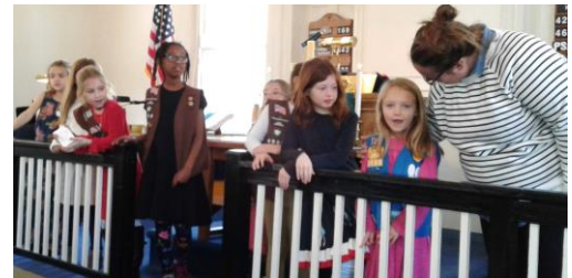
10:00 introduction of the Troop