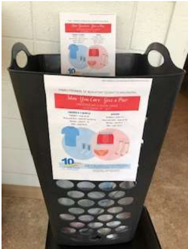
Our donation basket... underwear & socks for Family Promise in the Fellowship Hall.